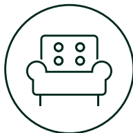
Break out areas with TVs