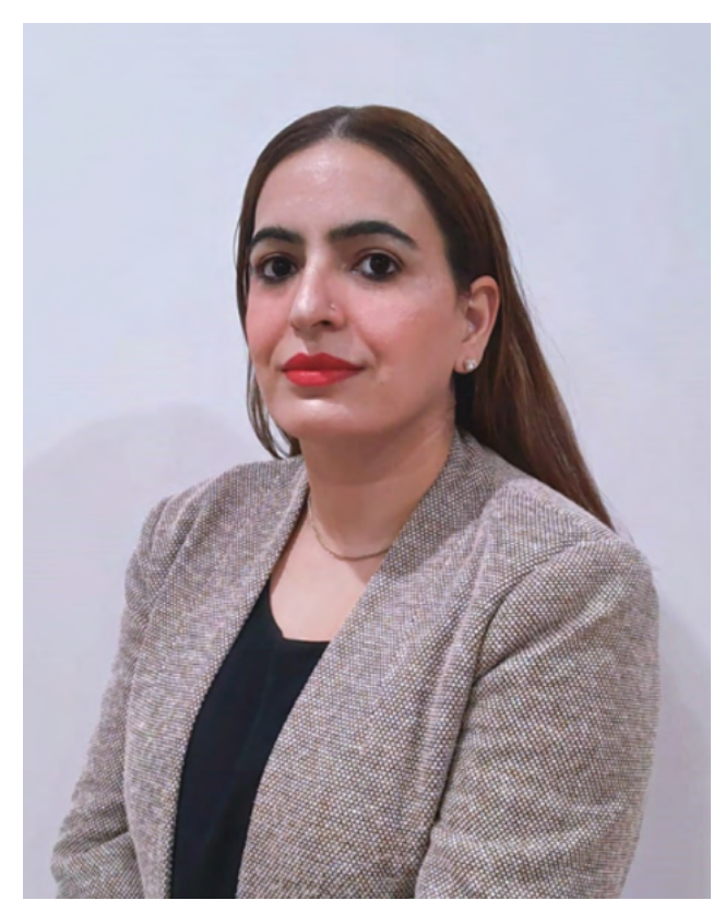
What is a special memory you have so far from your nursing career?

I enjoy the enormous responsibility that comes with being a care coordinator, as well as the opportunity to influence how the treatment and care of patients evolve and progress within the healthcare organisation I am part of.