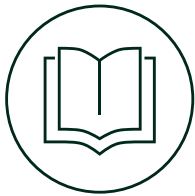
Library with computer & internet access