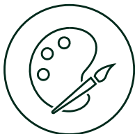
Organised activities & craft room