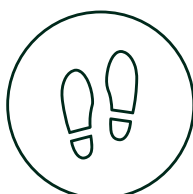
Large courtyards & walking paths