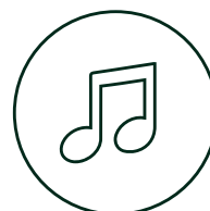
Music & entertainment events